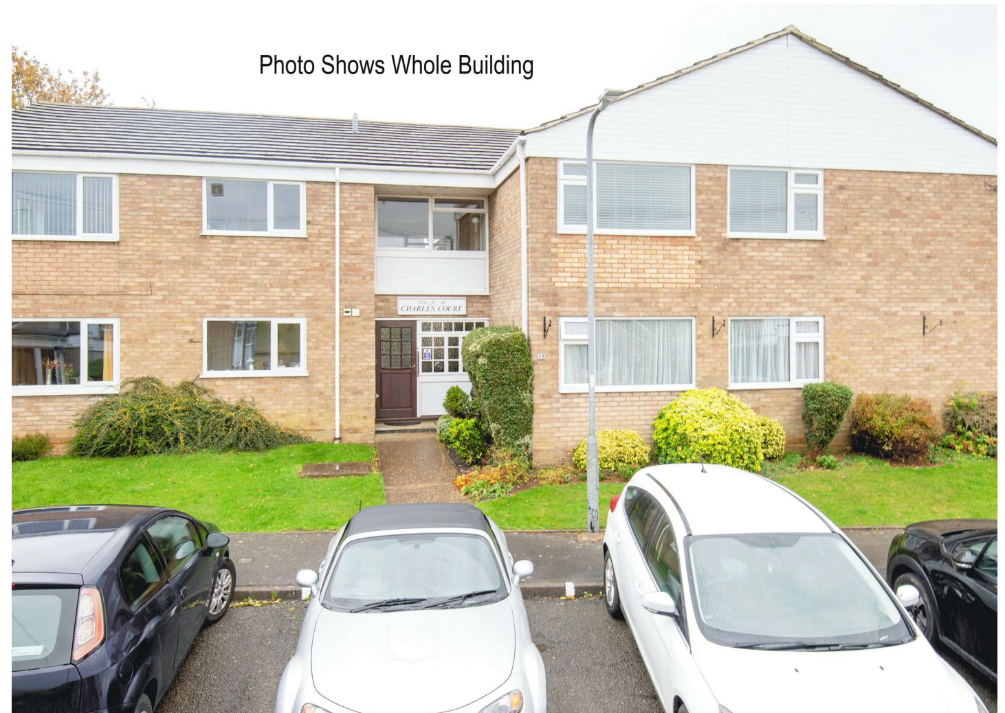
Photo Shows Whole Building

42 The Willows, Little Harrowden, Northamptonshire, NN9 5BJ